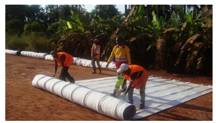
Widths unrolled perpendicular to the direction of traffic